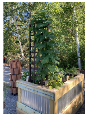
Beans growing tall in the JAK's Place community garden!

In 2023, we will seek an additional $2500 to support the expansion of this project.