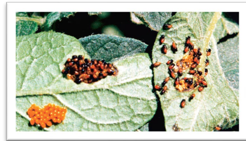
Figure 1. Egg masses and early instar larvae of the Colorado potato beetle

Colorado potato beetle (CPB) – ( https://vegento.russell.wisc.edu/pests/colorado-potato-beetle/ ). Continue to scout populations of CPB adults especially as nearly all potato plants have emerged and most hilling operations are nearly complete in central Wisconsin. In southern Wisconsin, adults have now colonized much of the field and many egg masses have hatched into 1 st instar larval stages ( Fig. 1 ). Potato plants can tolerate varying levels of defoliation before they will suffer yield losses. The level of tolerance depends on the plant's growth stage. Flowering plants can tolerate the least defoliation, only 5-10% of total leaf area. Post-flower potato is able to withstand a slightly greater amount of defoliation, but since this is a critical point for tuber formation and bulking growers should limit the amount of feeding done by CPB. Growth stages ahead and behind these two points are more tolerant of defoliation.